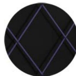
Double "X" screen mechanism