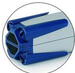
Unique "X" lock supporting feet

Case: Lightweight aluminium construction with integrated carry handle Screen Surface: 4:3 matt white screen surface with black borders on top and bottom edge, PET Screen Support: Friction based knuckle system incorporating unique double "x" frame Case Lock: ABS/Polycarbonate based spring assisted secure push and release latch mechanism Carry Handle: Thermoplastic Elastomer (TPE) based soft feel textured rubber handle Support Feet: ABS/Polycarbonate based fold-down click-lock feet